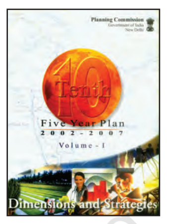
Tenth Five Year Plan document

The Second FYP stressed on heavy industries. It was drafted by a team of economists and planners under the leadership of P. C. Mahalanobis. If the first plan had preached patience, the second wanted to bring about quick structural transformation by making changes simultaneously in all possible directions. Before this plan was finalised, the Congress party at its session held at Avadi near the then Madras city, passed an important resolution. It declared that 'socialist pattern of society' was its goal. This was reflected in the Second Plan. The government imposed substantial tariffs on imports in order to protect domestic industries. Such protected environment helped both public and private sector industries to grow. As savings and investment were growing in this period, a bulk of these industries like electricity, railways, steel, machineries and communication could be developed in the public sector. Indeed, such a push for industrialisation marked a turning point in India's development.