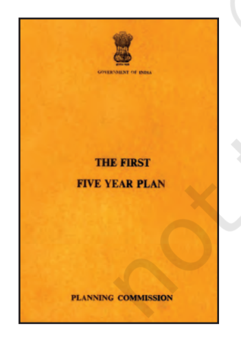
First Five Year Plan document

a five year basis as per the priorities fixed by the plan. A five year plan has the advantage of permitting the government to focus on the larger picture and make long-term intervention in the economy.